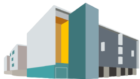
Faculty of Modern Languages, University of Caen Normandy (UNICAEN)

The promotion of Applied Foreign Languages curricula including the study of languages and vocational subjects such as law, management, communication, IT at the European level.